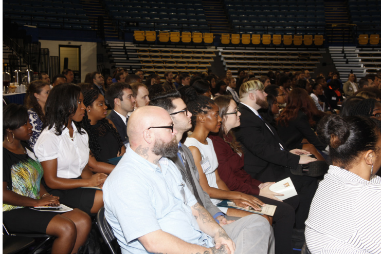
SULC Orientation, August 2017

While the Law Center does not prescribe any specific pre-legal preparation, it strongly recommends a foundation consisting of such courses as English, mass communications/journalism, public speaking, French, Spanish, accounting, psychology, logic, mathematics, and other analytical courses.