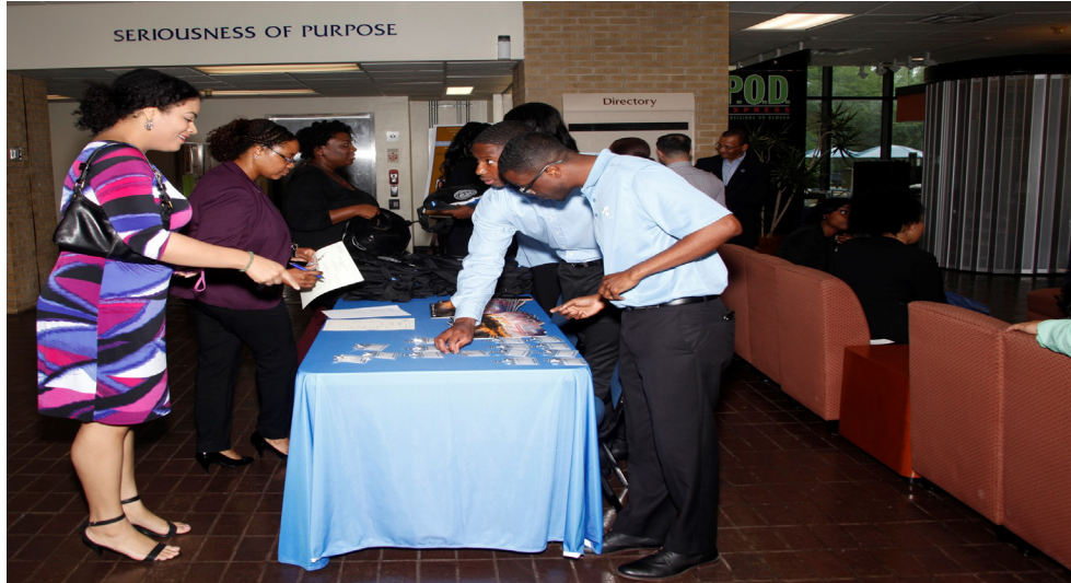
New students arrive for Admitted Student Day in April 2018