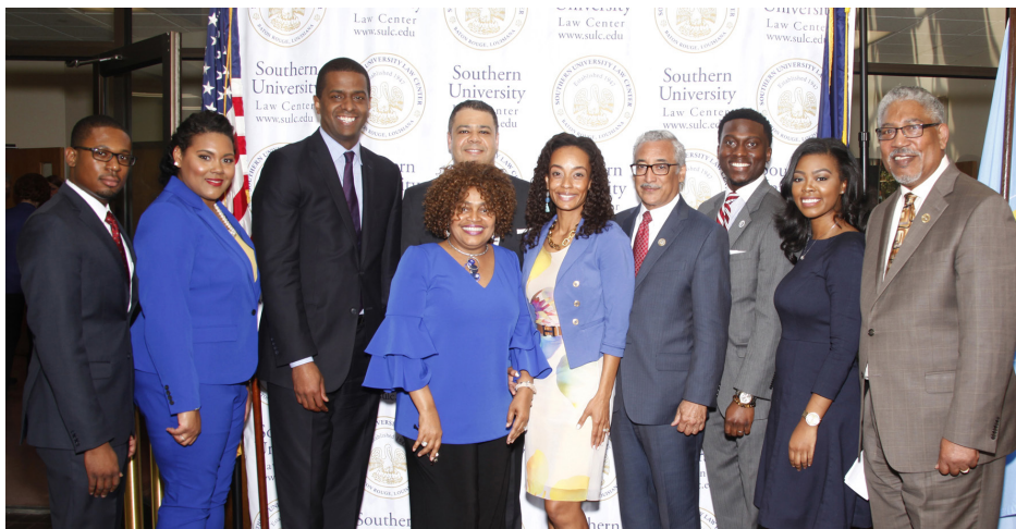
2018 Symposium The Overcriminalization of Minorities presented by The Journal of Race, Gender, and Poverty & The SULC Alumni Association

From the moment you begin law school until you secure your diploma at commencement and become an alumnus, the Southern University Law Center provides resources that support your development into a superior legal practitioner. These persons, programs, and activities are part of the life-changing experience you will have at the Law Center.